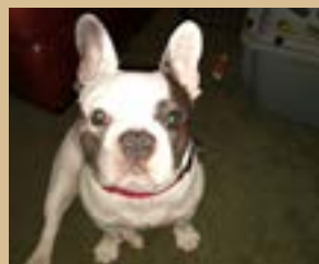
LILY Kansas City, MO