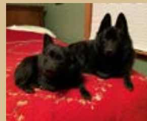
PERKE & SCHIPPER Kansas City, MO

Cat got your tongue?! Calling all cats to stand up and be recognized! Send your cat photos, with name and city of residence to ENGAGE@BlueKC.com .