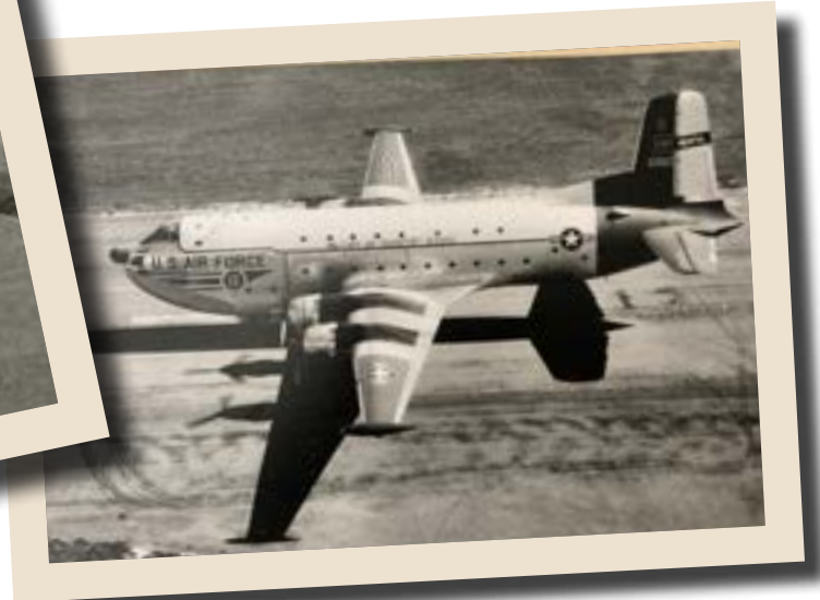
LEFT PHOTO: MEL (LEFT) AT DONALDSON AFB GREENVILLE, SC, 1957. RIGHT PHOTO: C124 GLOBE MASTER, BLACKJACK SQUADRON, NEW ZEALAND, 1958.