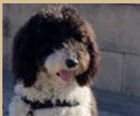
BUDDY Kansas City, MO